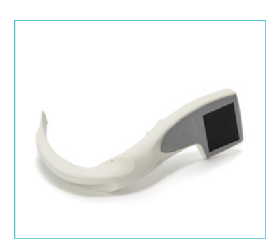
Airway Management • Airway Accessories