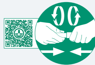
Push and Twist

A + B = A complete system ready for use Prioritising patient safety, providing clinical choice