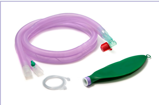
Flextube™ Silver Knight™ breathing systems