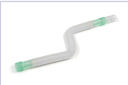
Compact™ bagging limb