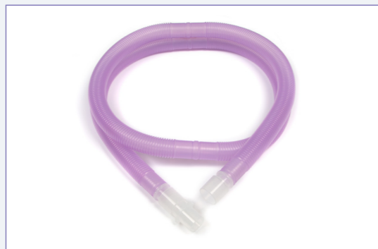
Flextube™ Silver Knight™ bagging limb